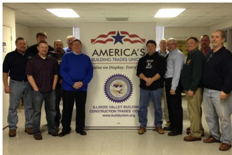
Illinois Valley Building Trades